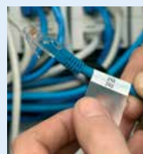
Wire marker labels & sleeves