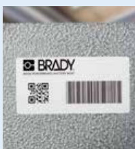
Asset tracking labels