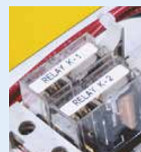
General purpose labels