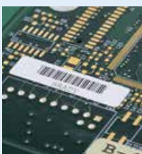
Circuit board labels