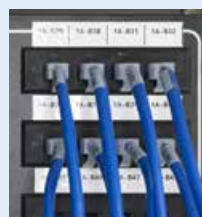
Voice & data communications